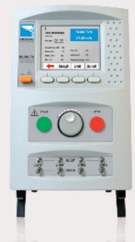
Multi-Flo Infusion Pump Analyser