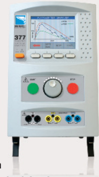
Uni-Therm ElectroSurgical Analyser